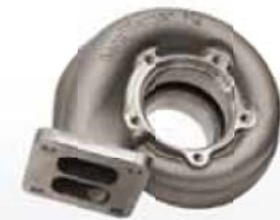
H-Type Turbine Housing

See page 37 for: Speed Sensor, Turbine Gaskets & V-Bands, Oil Drain Gasket & Fitting, Actuators & Brackets